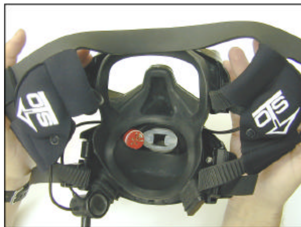
An EMD-2 fully installed in an M-48 mask

10. Adjust the mic to the correct position. The mic must be less than 1/4" from the diver's lips and must clear the side of the mouthpiece. Reposition the mic as needed to the side of the mouth. Reinstall the pod.